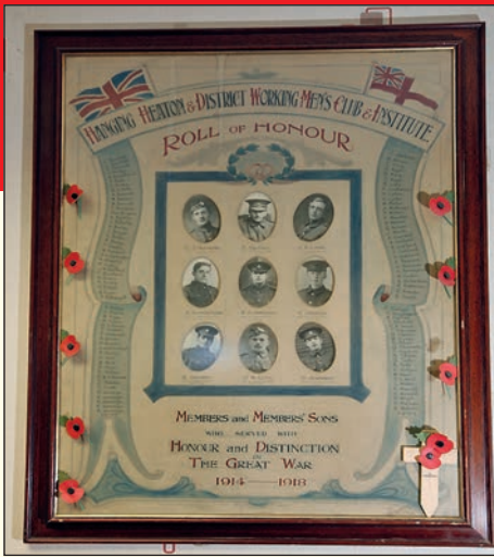
The First World War Roll of Honour in the club's main bar. The club itself was founded in 1907 and moved here in 1915.