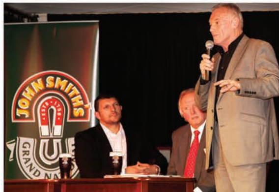
LEGENDS: Former Leeds winger Eddie Gray delivers some humorous anecdotes during his talk