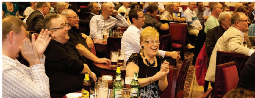
APPLAUSE: The 100 decision-makers from clubs across the Leeds area enjoyed a relaxed evening of entertainment coupled with some business-building ideas from the HEINEKEN in the UK team