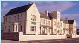
CIU SALTburn HOUSE