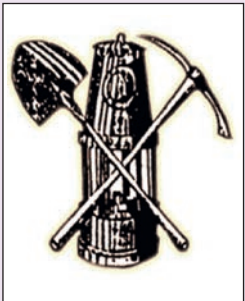
The club's mining heritage is reflected in its logo.