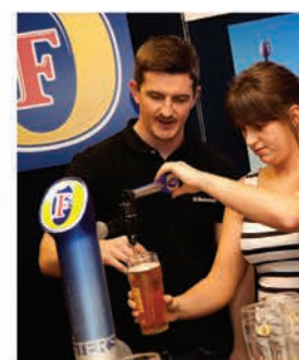
PERFECTION: Club representatives were able to try out the new Foster's fount